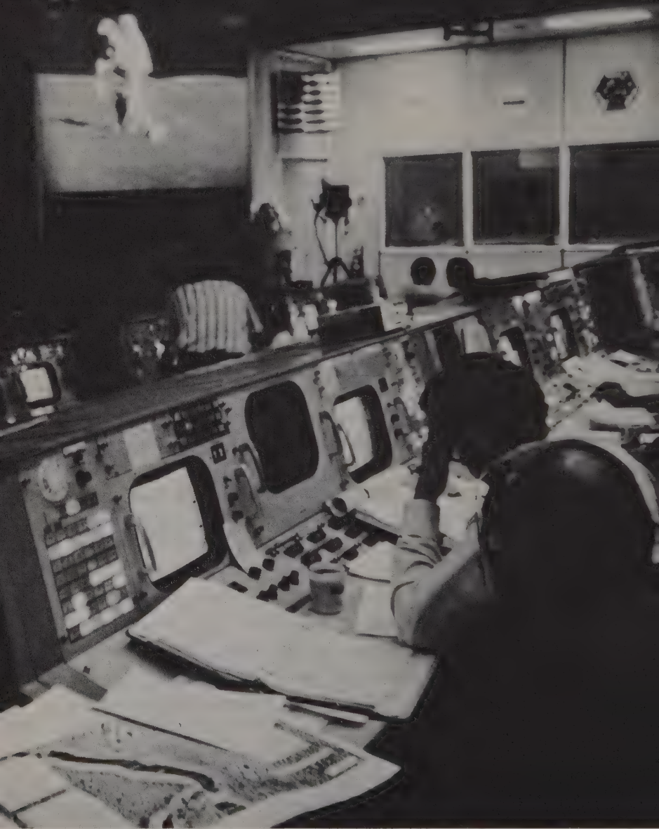
Without Mission Control in Houston the Apollo 15 mission— and other missions—could not have succeeded.