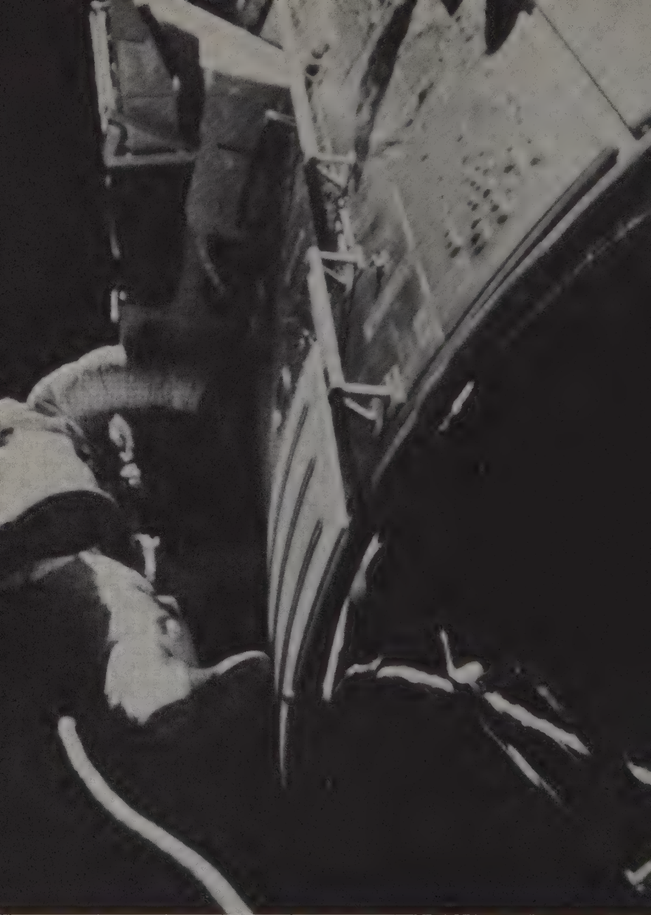
Astronaut Worden went through his “spacewalk”—note the umbilical attachment.