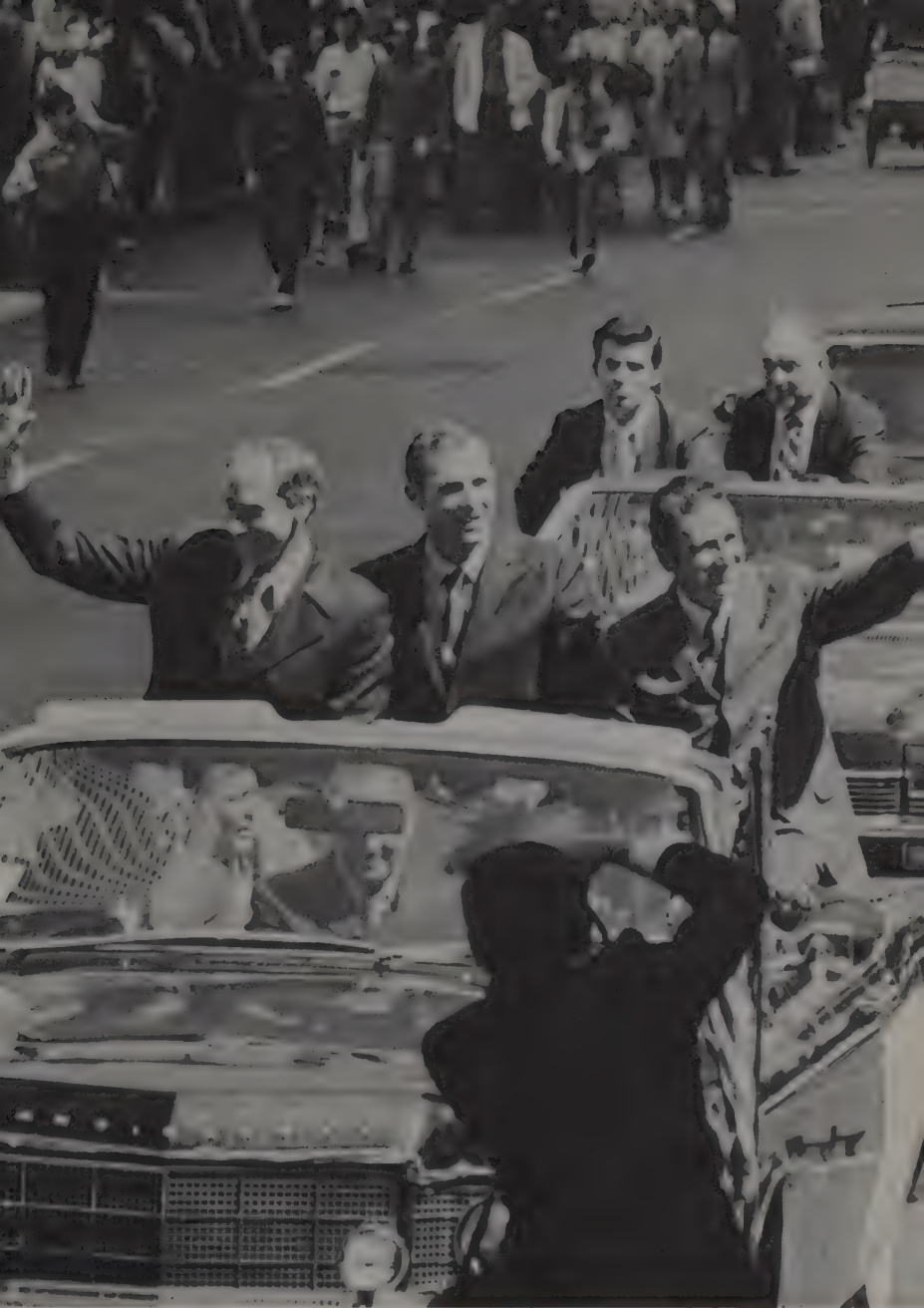
New York City gave the Apollo 15 astronauts a tumultuous welcome.