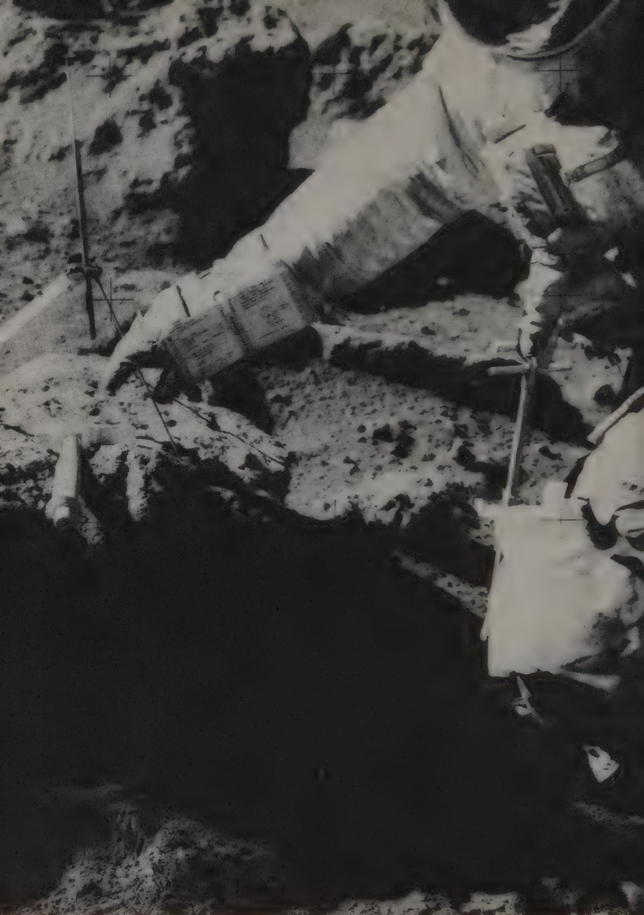
We constantly referred to the checklists on our spacesuit sleeves.