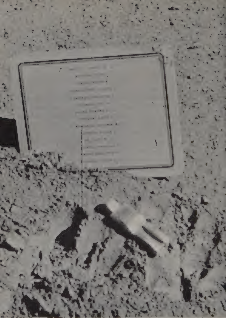
The Apollo 15 crew left this plaque memorializing all astronauts and cosmonauts who have died during their space programs.