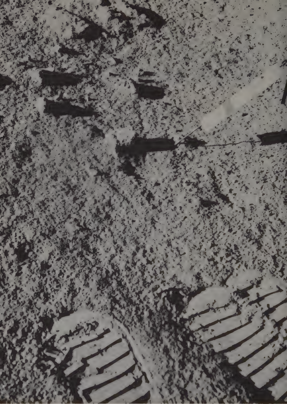
Jim Irwin looked down and photographed his footprints on the moon's surface.