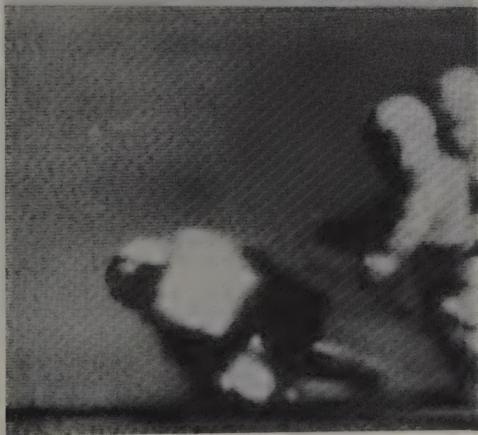
Astronaut Irwin rushed to assist Astronaut Scott who had fallen during a moonwalk.